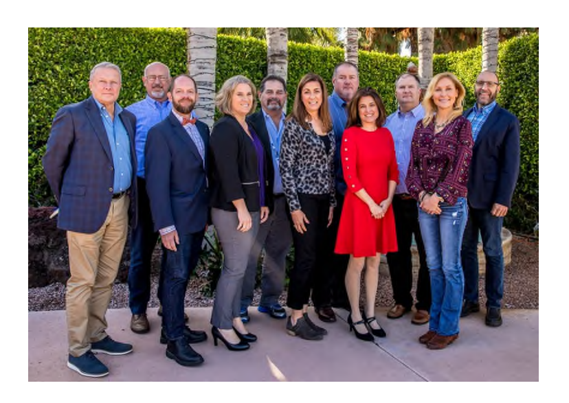
NAOC's 2020 Board of Directors