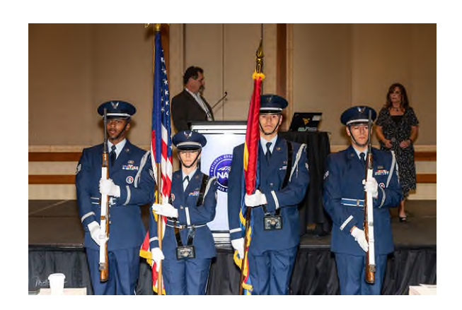
Arizona National Guard